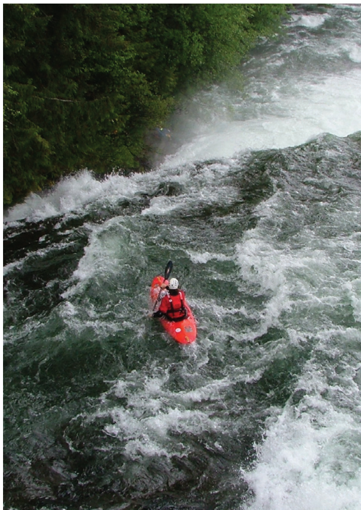
Stotan Falls, Puntledge River, B.C.

BC Hydro and its regulators and stakeholders and First Nations, followed the steps in the WUP Guidelines to find a better balance among competing interests at each of the roughly thirty facilities. The first meetings were held in the late 1990s and the last engagement meeting was held in the summer of 2004. All but one of the processes ended in consensus among the participants and many of the outcomes represented joint improvements from an environmental, social, and a financial point of view.